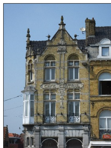
Cafe Central, Grote Markt