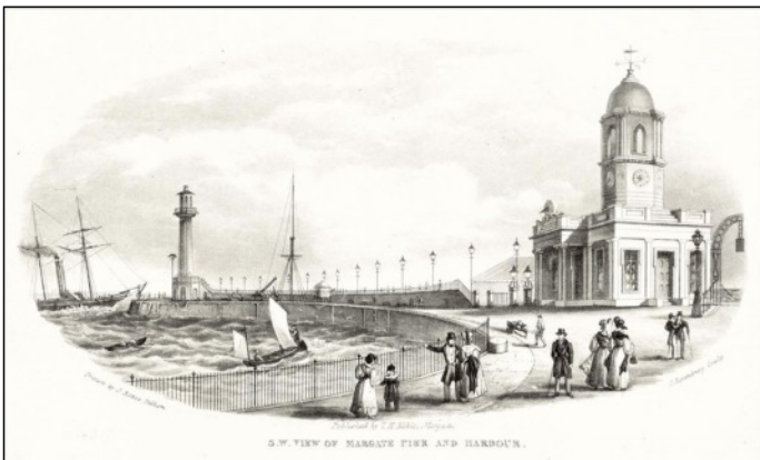
A nineteenth-century engraving of Margate Pier and Harbour with the original Droit House on which the sun-dial can be seen above the entrance door