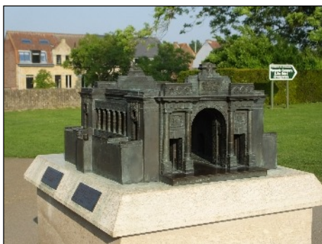
The magnificent bronze model, located on the Ramparts, of the Menin Gate Memorial