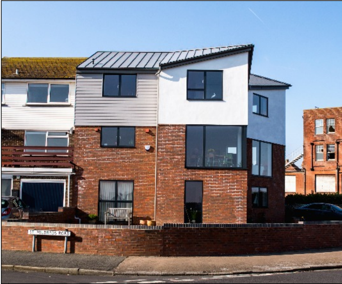
35 Sea Road, Westgate-on-Sea