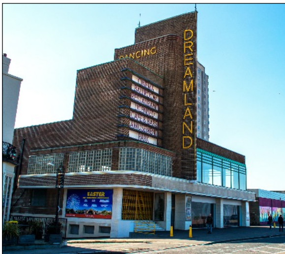
Former Dreamland Cinema (exterior), Marine Terrace