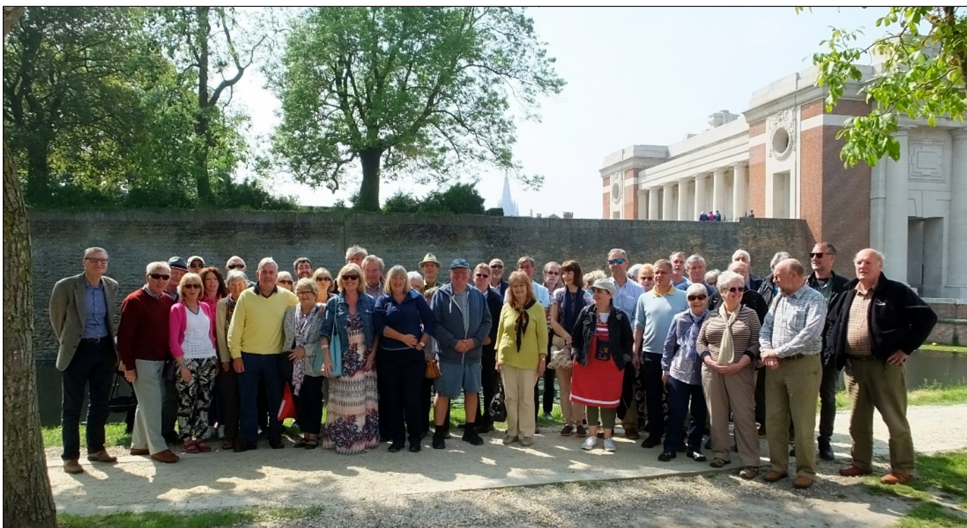
Our coach party on arrival at the Menin Gate Memorial to the Missing