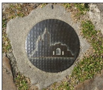
These attractive bronze pathway-markers indicate the heritage trail around Ypres. The markers feature (L to R) the Cloth Hall, St Martin's Cathedral and the Menin Gate Memorial