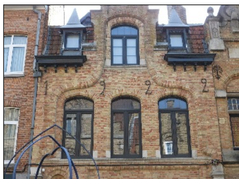
Rebuilt 1922, Boomgaardstraat