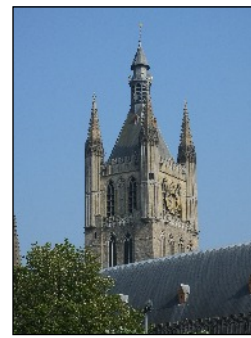
Top of the Cloth Hall tower