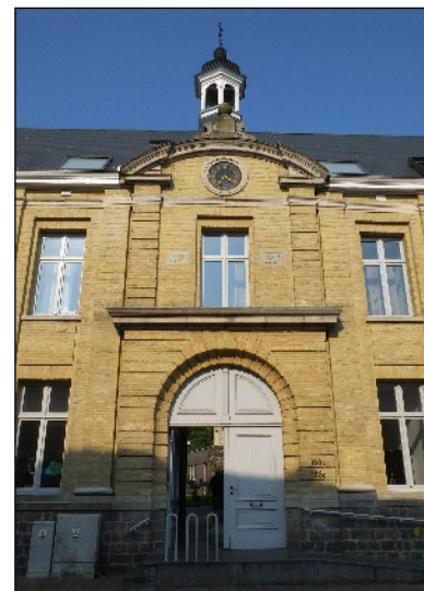
The Nazareth building in Rijselstraat. Before and after the Great War, it was used as the town's old-men's hospice and later as the police station. It has recently been converted to residences. The dates shown on the front of the building (1914 and 1918) indicate its period of non-existence