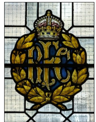
Royal Flying Corps Memorial Window, St George's Memorial Church, Elverdingestraat