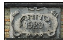
Close-up of the year-date on Cafe Central showing that it was built in 1929