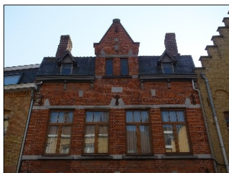
Rebuilt 1922, Dehaernestraat