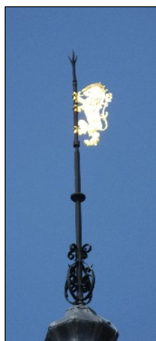
The guilded Belgian Lion weather-vane atop the Courts of Justice in the Grote Markt. The building faces the Cloth Hall

I hope that readers of the Newsletter will enjoy looking at these photographs as much as I enjoyed taking them during our one-day visit to Ypres. □