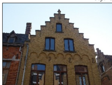
Rebuilt 1922, Dehaernestraat