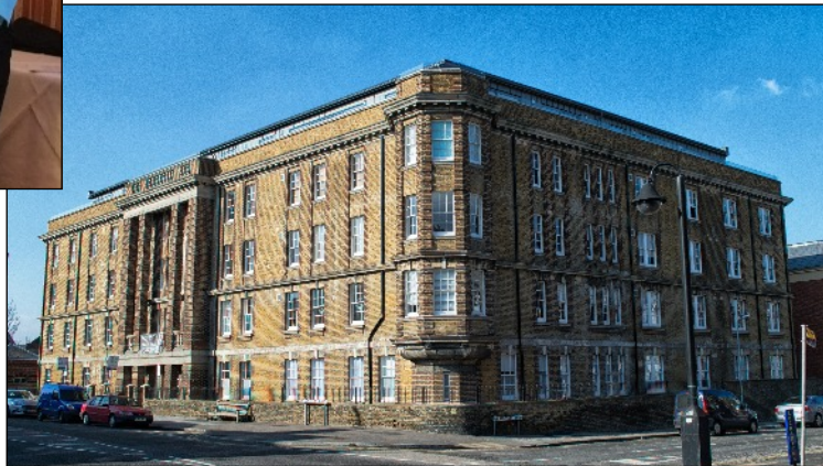
Former Nurses' Home, Canterbury Road, Margate