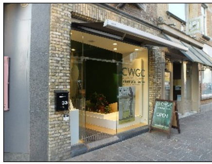
The Commonwealth War Graves Commission Information Centre, Menenstraat