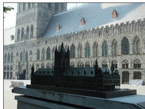
The magnificent bronze model of the Cloth Hall to be found near the front of the Cloth Hall