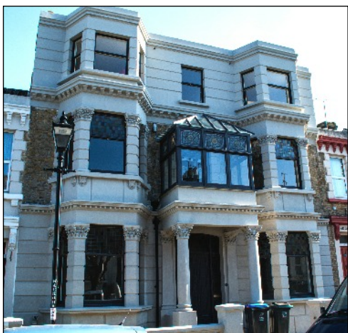
12 Arthur Road, Cliftonville