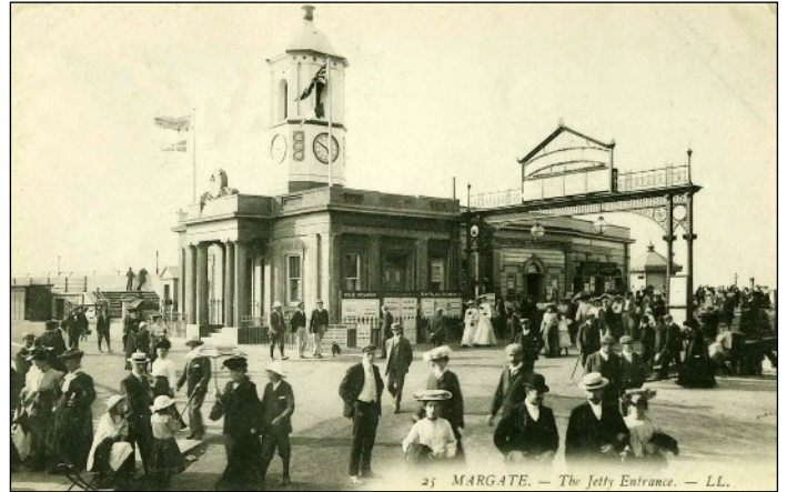
An Edwardian postcard of the original Droit House still showing the sun-dial above the entrance door

Sun-dials were regularly installed on public buildings and churches, but those with complications such as described here, were far from commonplace. One example that springs to mind is the one that still graces the wall of St Lawrence's Church, in the Derbyshire village of Eyam. Although this predates our Margate example by some 50 years, it provides us with an insight into what we might have seen locally.