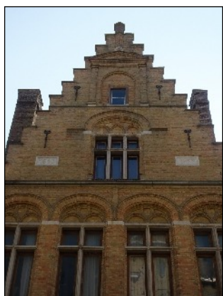
Original built in 1640, rebuilt in 1922, Dehaernestraat