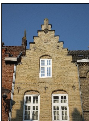
Rebuilt 1922, Boomgaardstraat