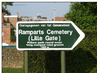
CWGC signpost on the ramparts at the Menin Gate