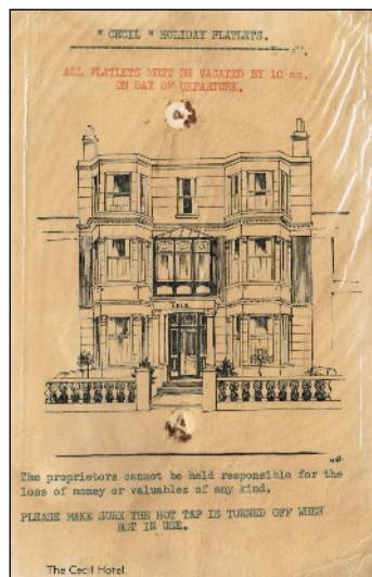
This advertising leaflet dates from the time when 12 Arthur Road was operating as The Hotel Cecil (probably in the 1950s)