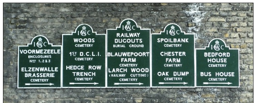
IWGC (Imperial War Graves Commission) signposts at the Lille Gate. The Imperial War Graves Commission was renamed the Commonwealth War Graves Commission in 1960