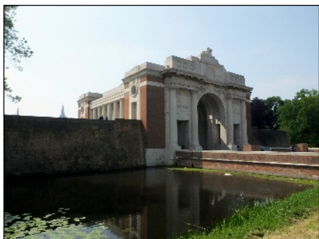
The Menin Gate Memorial to the Missing. The architect of this fine building was Sir Reginald Blomfield.