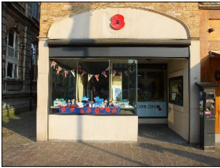
The Royal British Legion Poppy Shop, Grote Markt