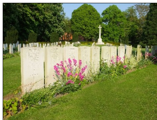
CWGC Ramparts Cemetery (Lille Gate). This cemetery, on the bank of the moat around Ypres, has to be one of the CWGC's most attractive cemeteries