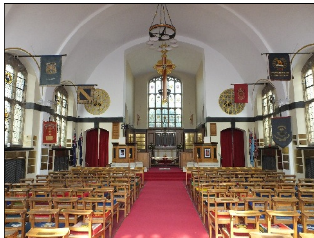
The Nave, St George's Memorial Church. Every object in this church was given in memory of someone who fell in the Great War or some organisation that was involved in the Great War