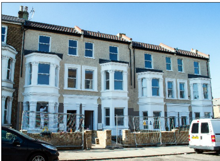
40-46 Sweyn Road, Cliftonville