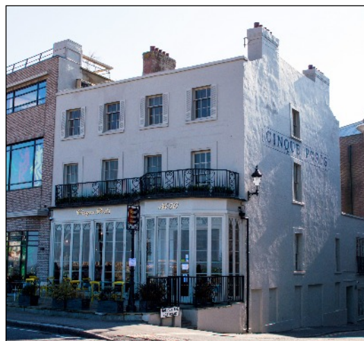
Cinque Ports PH, Marine Terrace