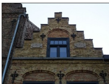
Rebuilt 1922, Vandenpeereboomplein