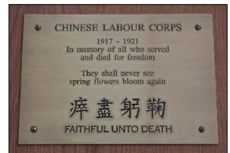
Memorial Plaque to the Chinese Labour Corps, St George's Memorial Church. This plaque was erected around ten years ago