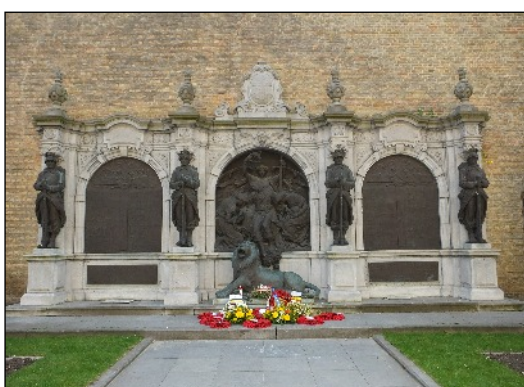
The Belgian 1914-18 Memorial, Vandennepeereboomplein