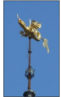
The guilded fiery dragon weather- vane atop the Cloth Hall tower