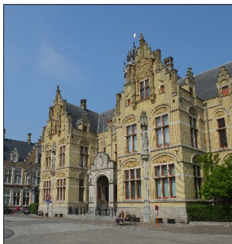
The Courts of Justice, Grote Markt