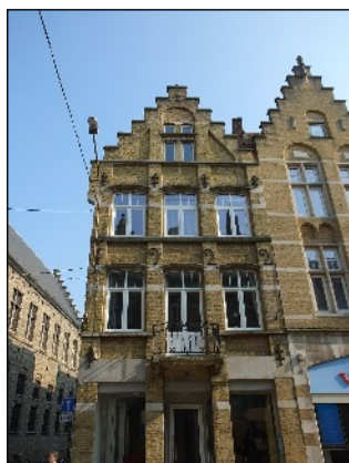
Rebuilt 1922, Boomgaardstraat

The town of Ypres was totally destroyed by enemy action in the Great War. Many of the houses were rebuilt in the 1920s in exactly the same architectural style as they had been built before the Great War but the rebuilding of the Cloth Hall was not finally completed until 1967. Many of the houses proudly display on their facade, the year in which they were rebuilt as can be seen in many of the following photographs: