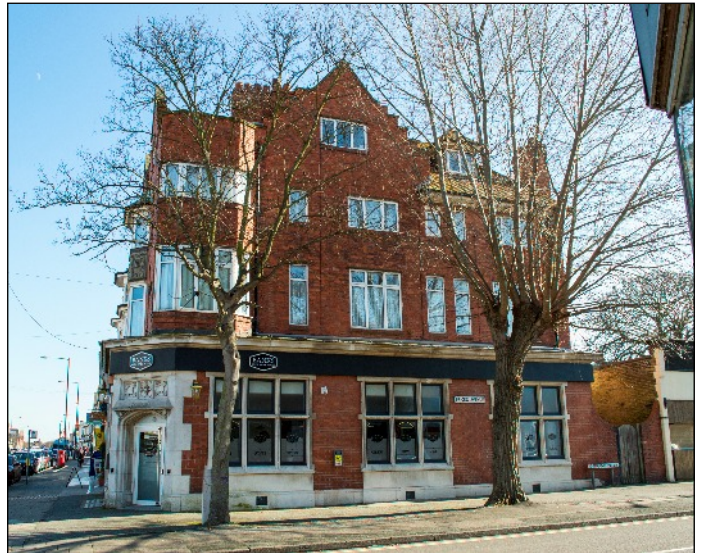
Banks Ale & Wine House, 244 Northdown Road, Cliftonville