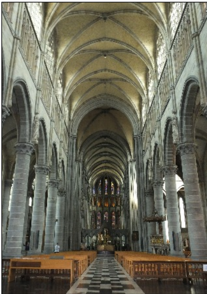
The Nave, St Martin's RC Cathedral. Note the height of the Nave