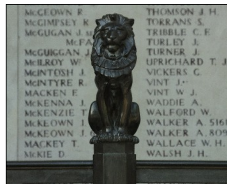
One of the many bronze 'guardian lions' on the upper floor of the Menin Gate Memorial