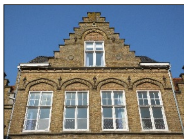
Rebuilt 1922, Boomgaardstraat